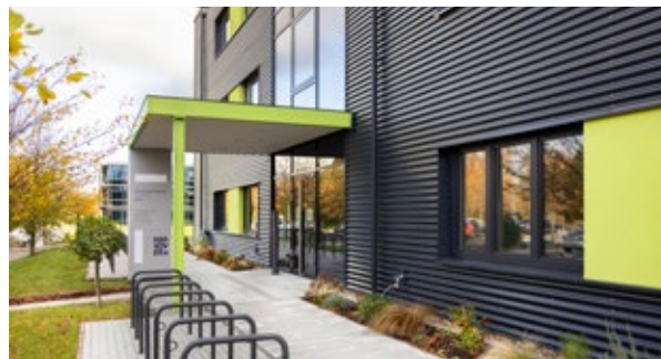
SCIENCE AREA 30X

Every fifth new business in Germany is now being started by a woman. The UNTERNEHMERINNEN ZENTRUM HANNOVER provides advice, office space and a strong support network for women.